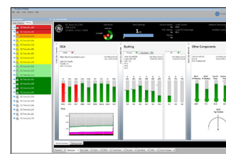
Transformer health/risk overview